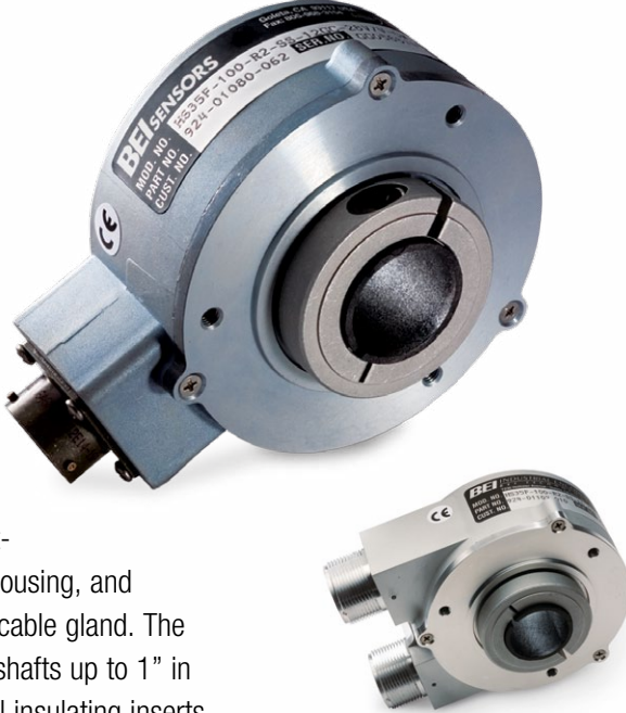
The HS35 Dual Output Encoder

The HS35 combines the rugged, heavy-duty features usually associated with shafted encoders into a hollow shaft style. Its design includes dual bearings and shaft seals for NEMA 4, 13 and IP65 environmental ratings, a rugged metal housing, and a sealed connector or cable gland. The HS35 accommodates shafts up to 1" in diameter. With optional insulating inserts, it can be mounted on smaller diameter shafts. It can be mounted on a through shaft or a blind shaft with a closed cover to maintain its environmental rating. The HS35 is also available with a dual output option (inset) to provide redundant encoder signals, dual resolutions, or to supply two separate controllers from a single encoder. Applications include motor feedback and vector control, printing industries, robotic control, oil service industries, and web process control.