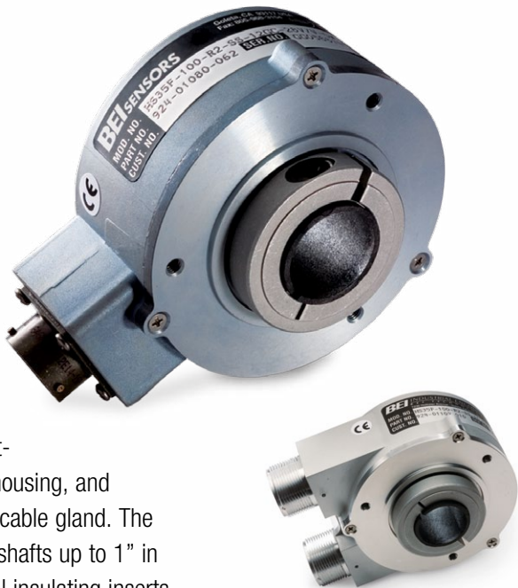
The HS35 Dual Output Encoder

The HS35 combines the rugged, heavy-duty features usually associated with shafted encoders into a hollow shaft style. Its design includes dual bearings and shaft seals for NEMA 4, 13 and IP65 environmental ratings, a rugged metal housing, and a sealed connector or cable gland. The HS35 accommodates shafts up to 1" in diameter. With optional insulating inserts, it can be mounted on smaller diameter shafts. It can be mounted on a through shaft or a blind shaft with a closed cover to maintain its environmental rating. The HS35 is also available with a dual output option (inset) to provide redundant encoder signals, dual resolutions, or to supply two separate controllers from a single encoder. Applications include motor feedback and vector control, printing industries, robotic control, oil service industries, and web process control.