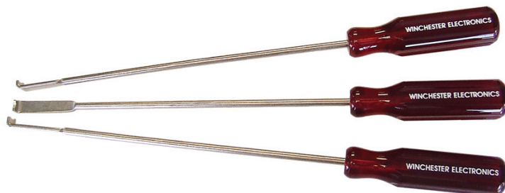
Extraction Tool Part Number 107-1506