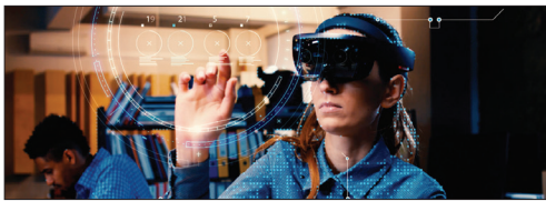
Augmented Reality (AR) / Virtual Reality (VR) devices