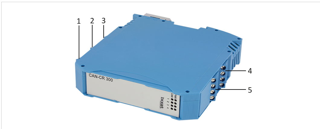
Fig. 3 Connectors