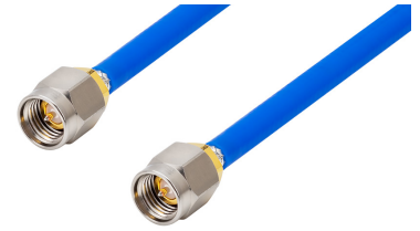
Generic photo used for illustration purposes only