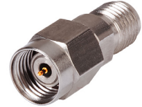
Generic photo used for illustration purposes only