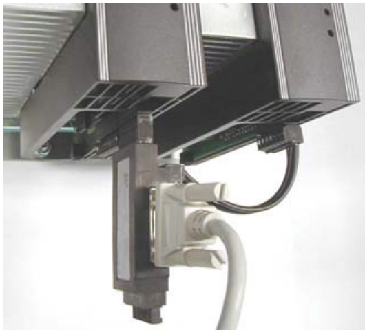
FIG. 3 THYRO-A 2A