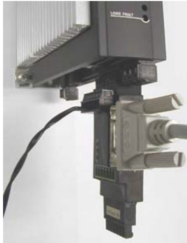
FIG. 1 THYRO-S

The connection of the interface at Thyro-S corresponds to fig. 1. Then the free upper 7-pin row is intended for the plug that was before on the connection present (set point wiring). The plug is to be put directly below the Thyro-S from left side on to the interface.