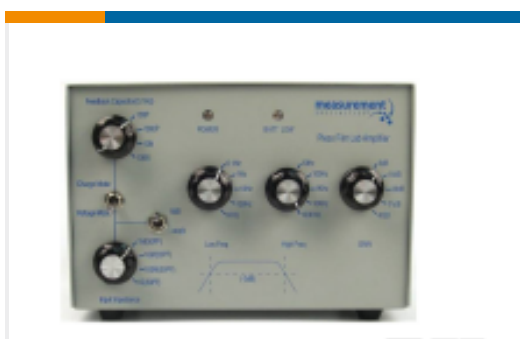
TE Part #1007214-3 AMPLIFIER&US POWER SUPPLY PLUG