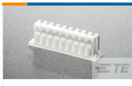
TE Part #1-440146-2 1.25mm WTB Socket,Housing,12p