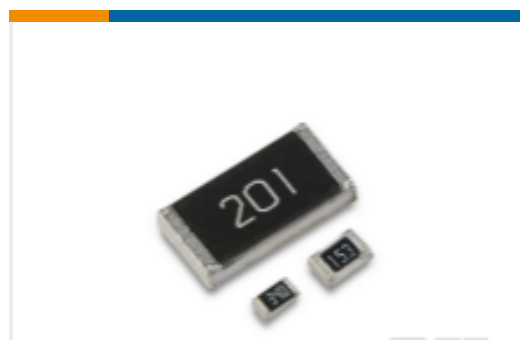
TE Part #4-2176326-3 CRGP 0603 33K 1%