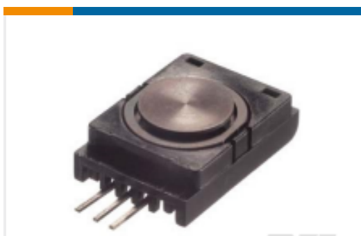
TE Part #FS2030-000X-0500-G FS2030 500G FORCE SENSOR