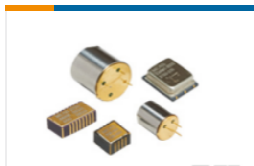
TE Part #3038-6000 Embedded Accelerometer STOCK LIST