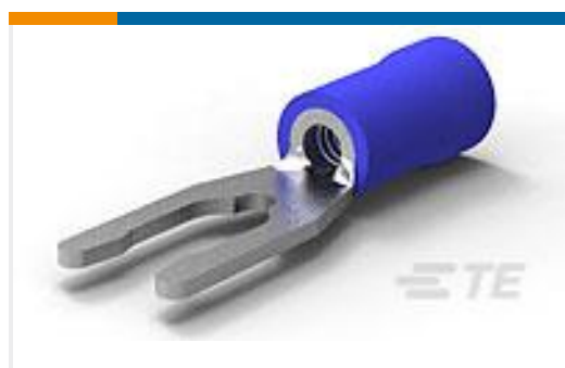
TE Part #52464 TERMINAL, PG SPR SPD 16-14 8