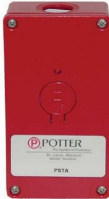
Stock No. 2040001