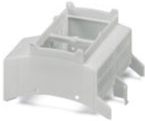
Upper part, Color: gray, Width: 71.6 mm

Please be informed that the data shown in this PDF Document is generated from our Online Catalog. Please find the complete data in the user's documentation. Our General Terms of Use for Downloads are valid ( http://phoenixcontact.com/download )