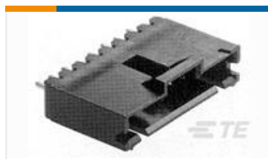
TE Part #147321-3 17 MTE VER HDR SR S.LOAD W/RET