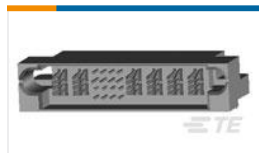
TE Part #1888114-3 MBXL R/A HDR 2P+16S+4P