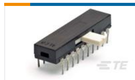
TE Part #2-1825010-5 ASE4304=4P3T AUTOSLIDE