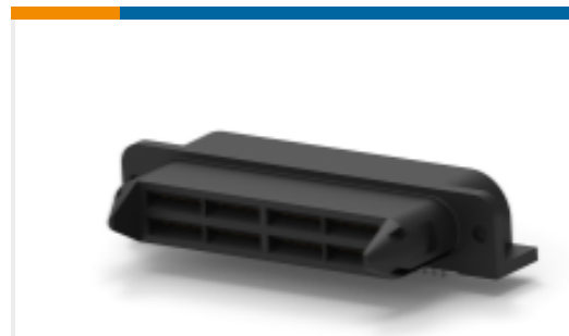
TE Part #766515-1 AMPOWER WAVE CRIMP HDR ASSY