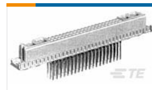
TE Part #5148420-5 ASSY,RECPT,TYPE M,EUROCARD,L-F