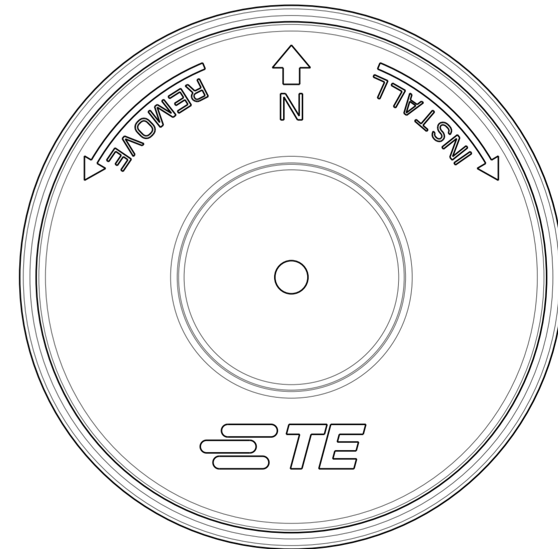
TOP VIEW FOR REFERENCE