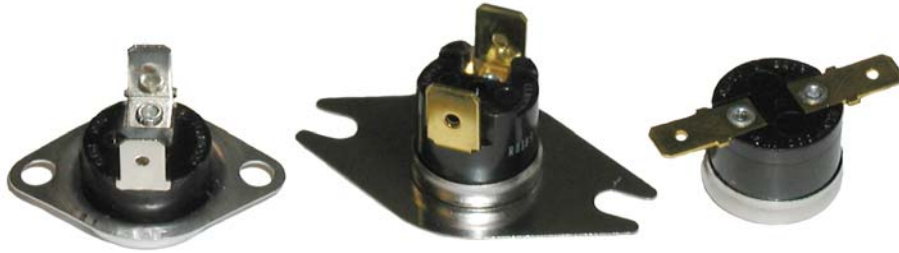
Figure 2. 2450R/2450HR/2455R/2452R/2452HR Series Phenolic Automatic Reset Thermostat

The 2450R/2450HR/2455R/2452R/2452HR Series is a single pole, single throw, snap-acting, non-adjustable thermostat which may be used in applications such as power supplies, general appliances and medical equipment. A temperature-sensitive bimetal disc, electrically and thermally isolated from the switch, is used to actuate the normally-closed contacts. Contacts open when surface or ambient temperatures increase to the operating set point of the calibrated bimetal disc. The entire switch is enclosed in a phenolic housing; the bimetal disc is retained by a metal heat-conducting end cap. Due to the small size of this unit and the inherently low mass of the bimetal snap-action disc, response of this thermostat to temperature changes is extremely rapid, compared to other commercially available thermostatic devices. A variety of mounting brackets and terminals are available.