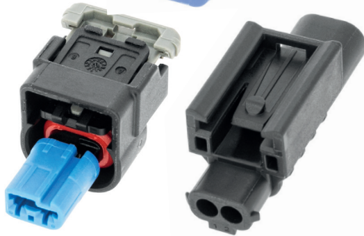
APEX ® 1.2 SensoMate ™ 2W Female & Male