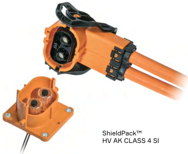
ShieldPack™ HV AK CLASS 4 SI