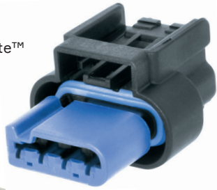
APEX ® 1.2 SensoMate ™ 4W Female