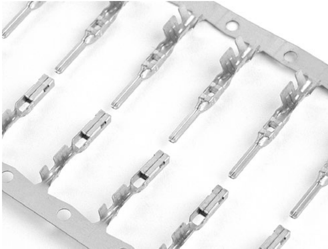
APEX ® 1.2 Female & Male Terminals