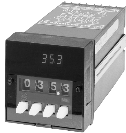
Shawnee II Digital Programmable Timer