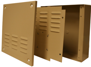
ABB-1012 INDOOR/OUTDOOR STEEL BELL BOX