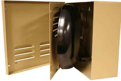
ABB-1033 12VDC MOTOR BELL AND BOX