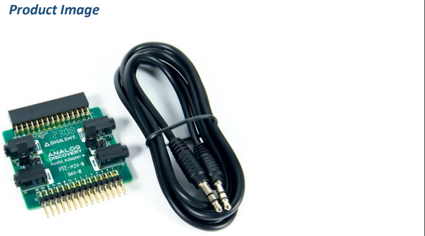
Image Links: https://flic.kr/p/2oyhj4j / (Oblique) https://flic.kr/p/2oyf3Lh / (Back)

Features Provides audio connectivity via 3.5 mm jacks for both Scope and Wavegen Inputs and outputs can independently use 2 mono jacks or 1 stereo jack, selected via jumpers Active circuitry powered by the Analog Discovery 3 power supplies Pass-through connector for all other Analog Discovery 3 signals, including Digital I/O, Triggers, and Power Supplies Compatible with the Analog Discovery 3