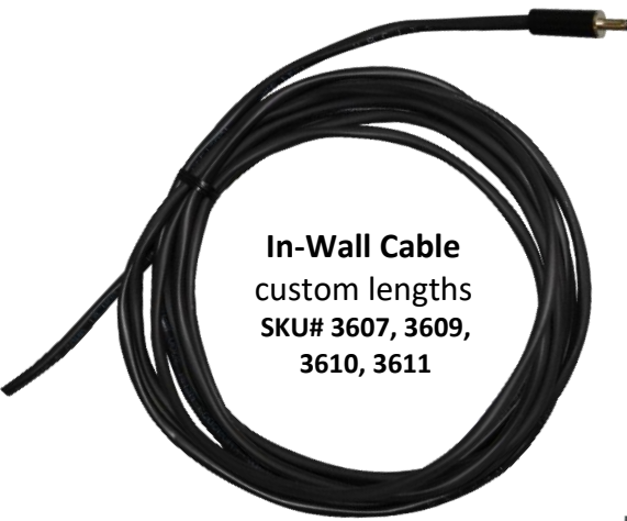
In-Wall Cable custom lengths SKU# 3607, 3609, 3610, 3611

Inspired LED's unique line of Interconnect Accessories are compatible with 3.5mm x 1.3mm DC input/output jacks. Cables are available in standard or custom lengths, and all interconnect products combine easily with Inspired LED flex strips and LED panels to create the perfect low-voltage lighting system for any location.