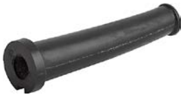
4804.0001 Sleeve black, 5.6 mm