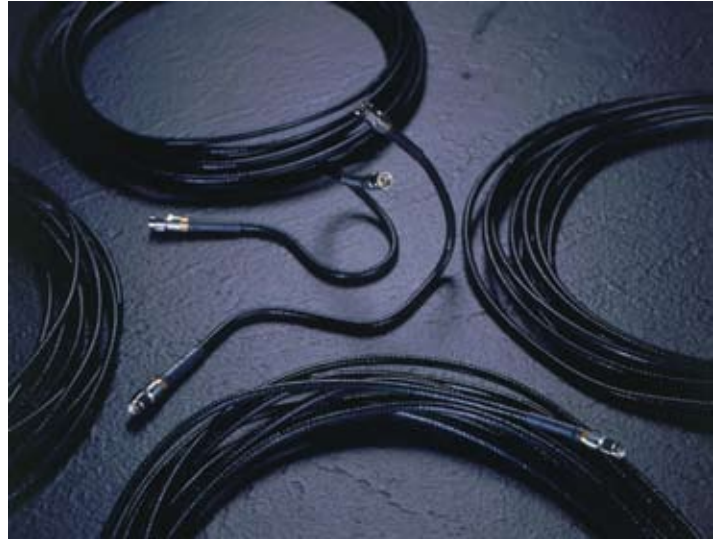
GORE™ RF Jumper Assemblies are available in a variety of lengths

The small bend radius makes these assemblies easier to route in tight spaces and a cable bend radius as small as 0.40 in (10.2 mm) is achieved with no degradation in electrical performance.