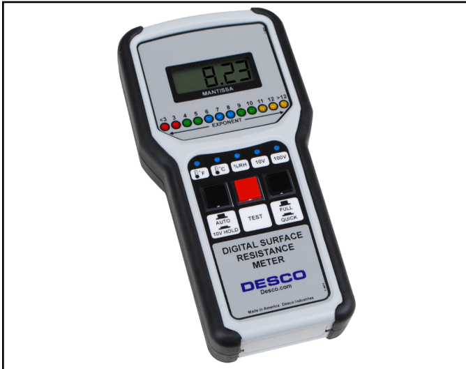
Figure 3. Desco 19788 Digital Surface Resistance Meter