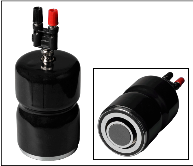
Figure 7. Desco 50005 Concentric Ring Probe

The Desco 50005 Concentric Ring Probe is an instrument to be used in conjunction with a resistance meter, such as the Desco 19787 Digital Surface Resistance Meter, to measure surface resistance per ANSI/ESD STM11.11 the test method listed in Packaging standard ANSI/ESD S541 for surface resistance of planar materials.