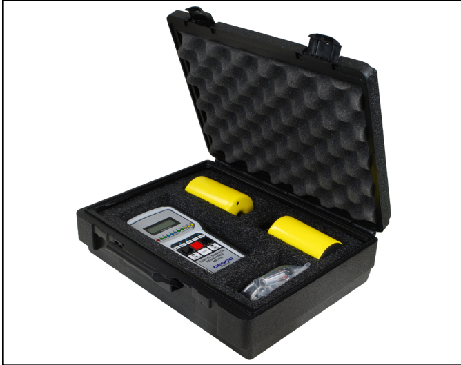
Figure 2. Desco 19787 Digital Surface Resistance Meter Kit