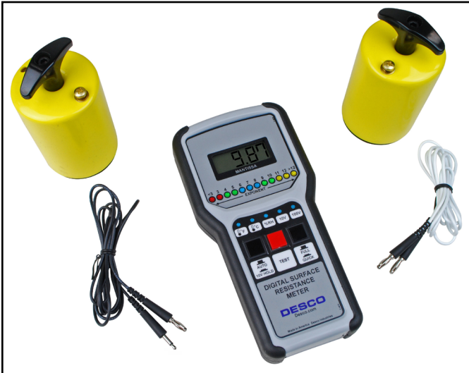
Figure 1. Desco Digital Surface Resistance Meter Kit