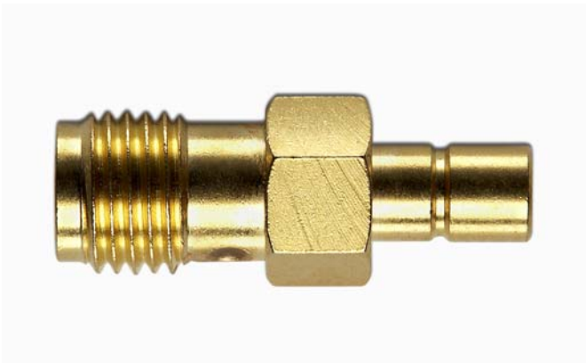
Model 72978 SMA (F) TO SMB (M)