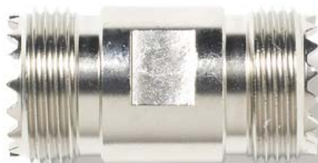
Model 73058 UHF Jack to Jack Adapter