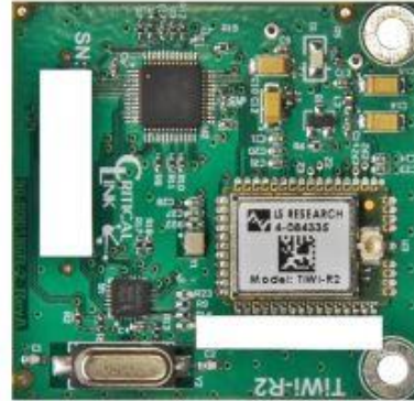
(1.7" x 1.8" – actual size)