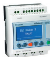
CD12 with display