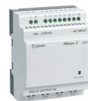
CB12 without display