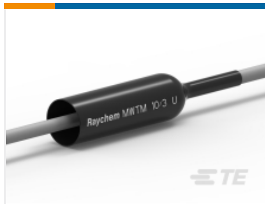
TE Part #834936-000 MWTM-10/3-100/S(S100)