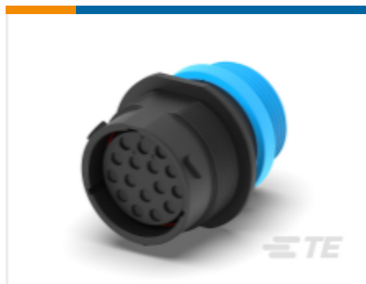
TE Part #HDP24-24-16SE-L015 REC, 16P, BLK, E, THD, 12, S