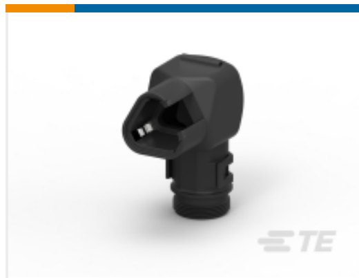
TE Part #1011-232-0305 BKSHL, 3P, BLK, PLG, RA, NW6/7.5/8.5 /10