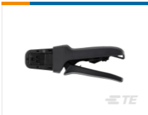
TE Part #DTT-20-03 CRIMP TOOL