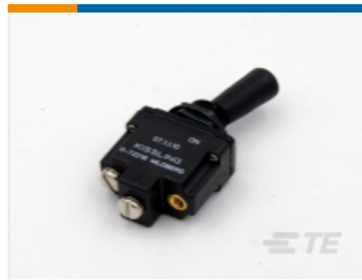
TE Part #K1007153 Toggle Switch 08-1-1-13