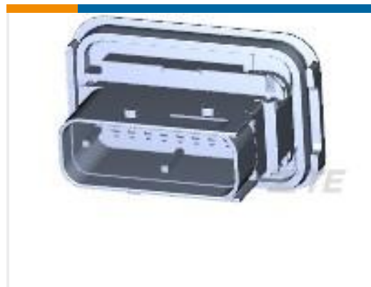
TE Part #2-1564532-1 15POS, MIXED,TAB HSG,ASSY