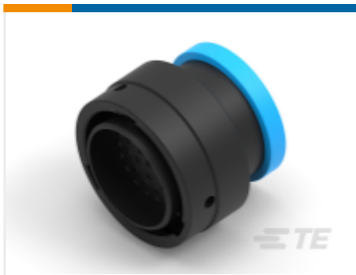
TE Part #YHDP26-24-35PEL017 PLG, 35P, BLK, E, RNG, 16/20, P