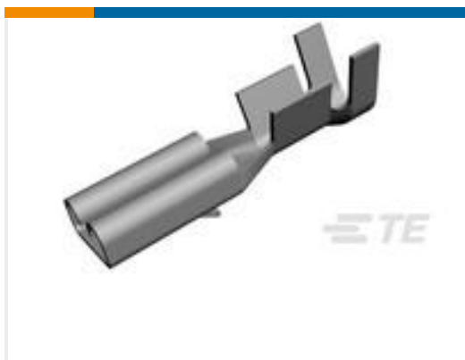
TE Part #160668-6 TERMINAL