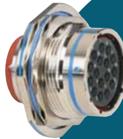
MS3474 jam nut receptacle