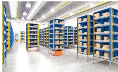
Lift & Materials Handling