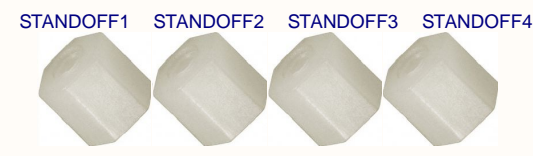
STAND-OFF Nylon #6-32 x 3/8"