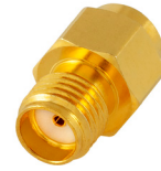
CASE STYLE: LL2641