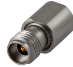
CASE STYLE: LL2592