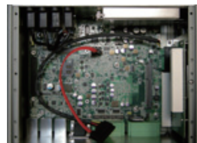
» Fanless Design

All specifications are subject to change without notice.