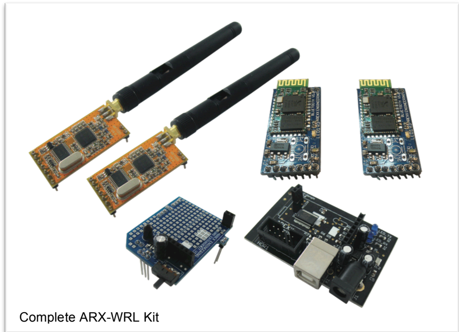
Complete ARX-WRL Kit