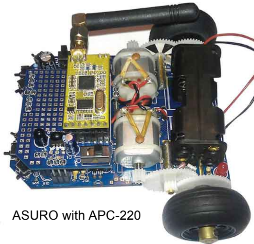
ASURO with APC-220