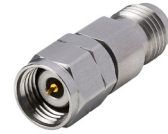
Generic photo used for illustration purposes only