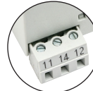
Remote contact signaling