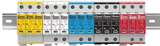
PV Wind Telecom UL IEC

Cooper Bussmann offers surge protection products for PV, telecom, UL and IEC applications.