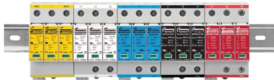
PV Wind Telecom UL IEC

Cooper Bussmann offers surge protection products for PV, telecom, UL and IEC applications.