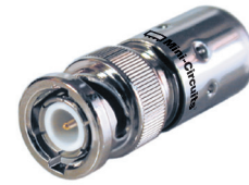
CASE STYLE: LL85