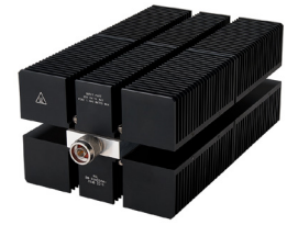
Generic photo used for illustration purposes only