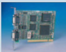
CC-530 PCI 2xRS422/485 15MBaud