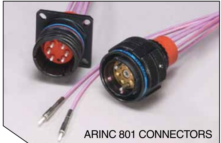
ARINC 801 CONNECTORS