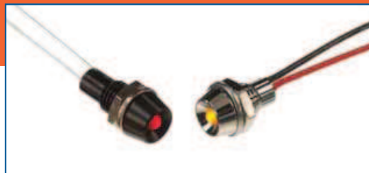
3mm Panel Mount LED Assemblies