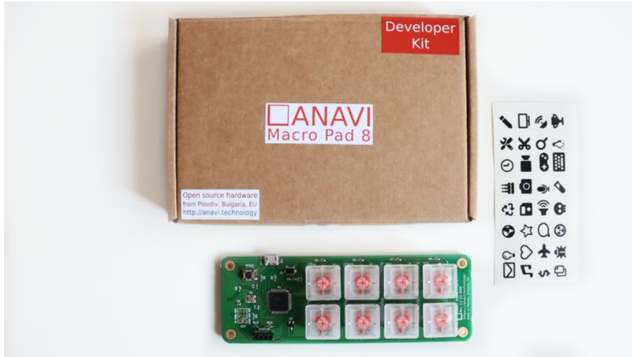
Figure 3: ANAVI Macro Pad 8 Developer Kit

The Developer Kit does not require any soldering. It features Gateron red mechanical switches and translucent keycaps with red backlighting. The Developer Kit is easy to get started with, and it is perfect even for newbies. Just pop the keycaps on, and you're ready to go.