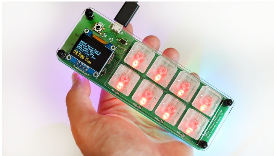
Figure 2: ANAVI Macro Pad 8