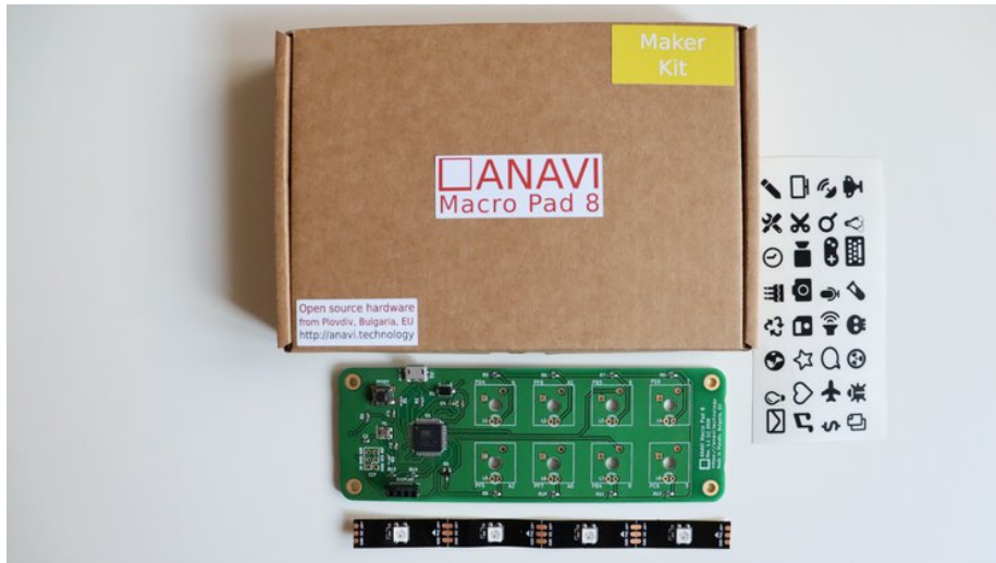
Figure 4: ANAVI Macro Pad 8 Maker Kit

programmed with whatever information you want through Arduino IDE.