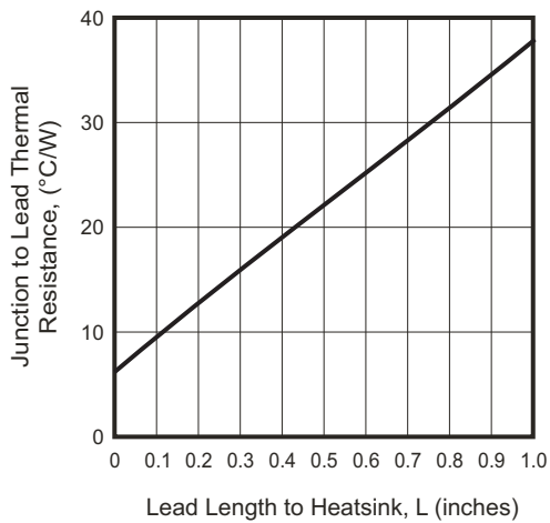
Fig.3 - Typical Thermal Resistance v.s. Lead Length